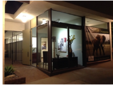
Our New U.S. Headquarters